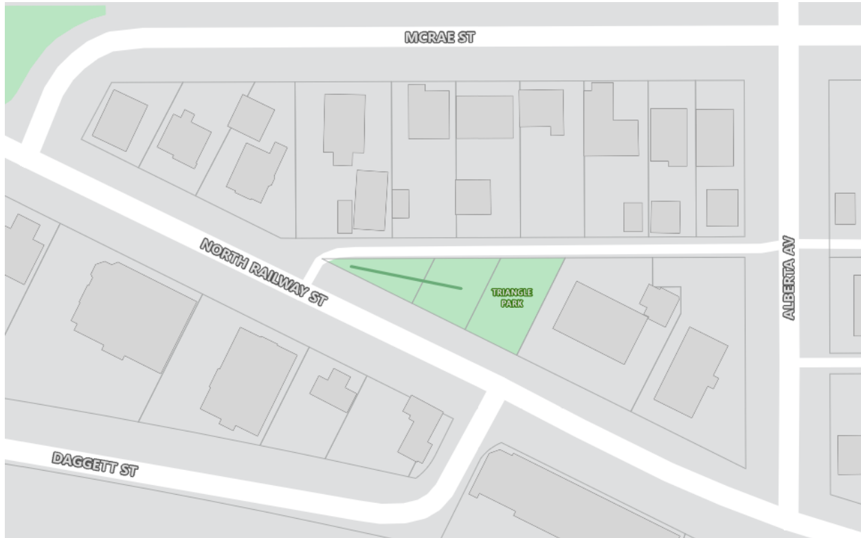
Figure 1: Location of Triangle Park in downtown Okotoks