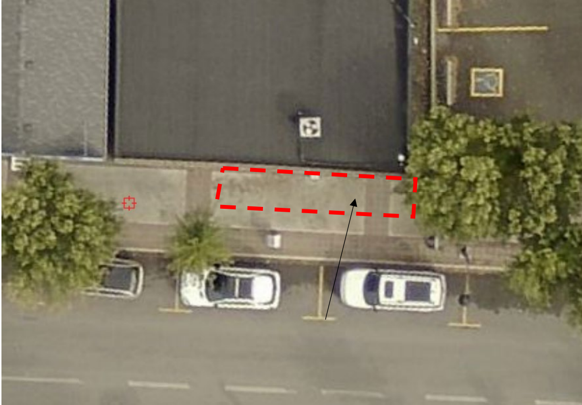
Potential Patio example