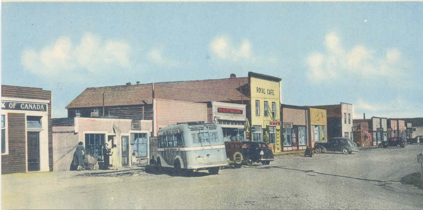
Postcard of Turner Valley, 1940s.