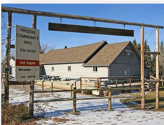
Priddis Community Hall.

Charles Priddis, however, when they were registering the name in Calgary they learned that 'St. Charles' was not recognized by the Church of England. They selected St. James instead. It still holds services each Sunday.