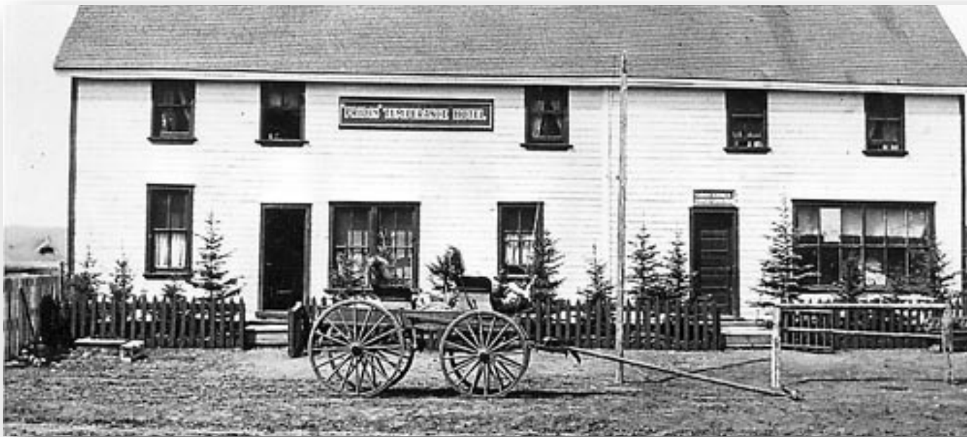
The Priddis Temperance Hotel, ca. 1908.