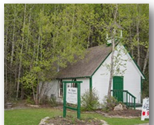
St. James Church, Priddis.