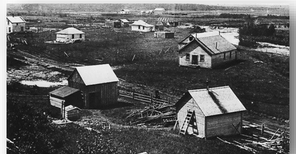
Hamlet of Priddis, early 1900s.