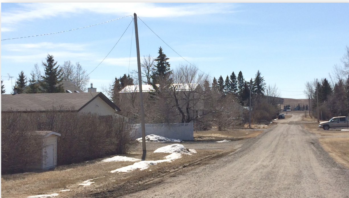
Looking south on Gibson Street in Naphtha, 2019.