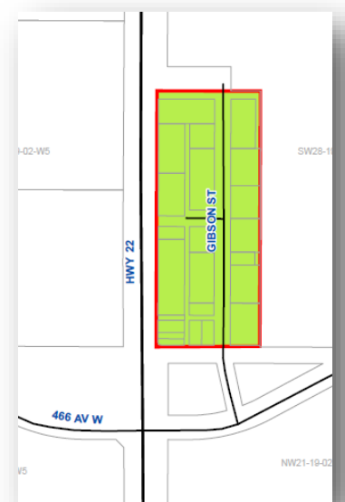
The hamlet today.

Sources: In the Light of the Flares , www.petropedia.com , and County of Foothills .