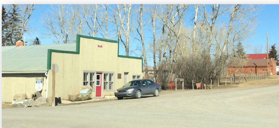
The former post office & store building, 2019.

When the Mercury Plant closed in 1960, workers moved away and businesses soon closed. The post office closed in 1971, but the store operated for a few more years.