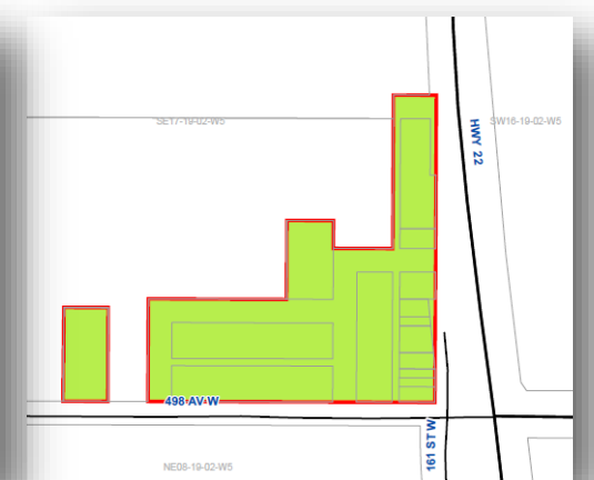
Hamlet of Hartell today.

Sources: Tales and Trails by the East Longview Historical Society, and County of Foothills.