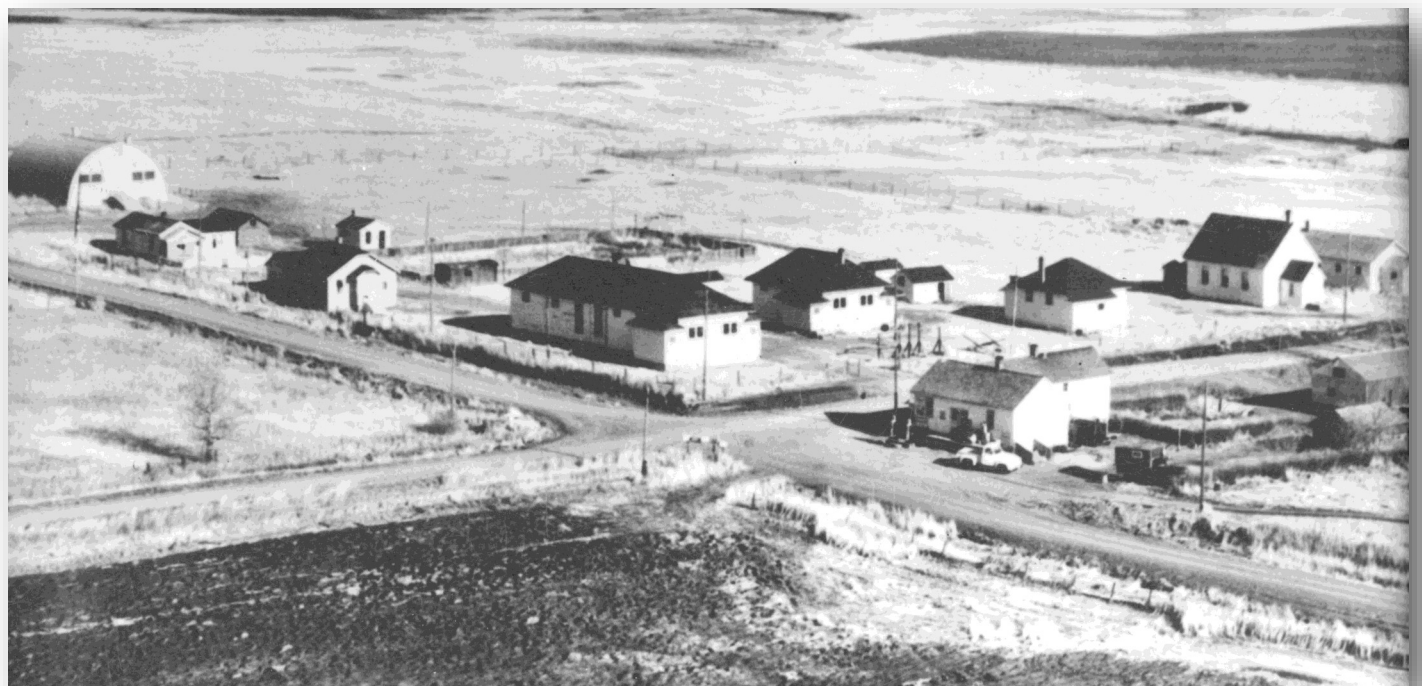
This 1953 photo shows, from the left, the community hall, teacherages, three schools that formed the classrooms of Ridgeview School, the general store in the foreground and far right is the Gladys United Church and church hall.

Source: Gladys-Dinton Through the Years .