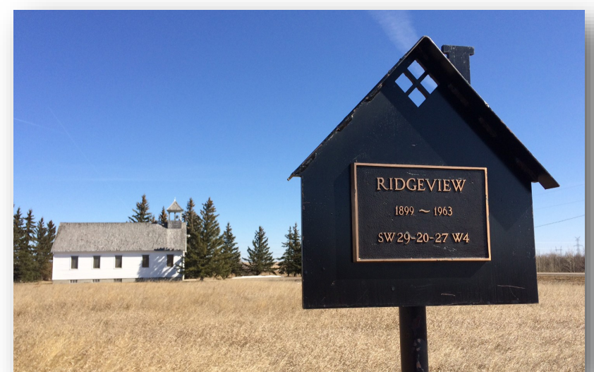
Ridgeview School marker and Gladys United Church at the Gladys Corner, 2019.