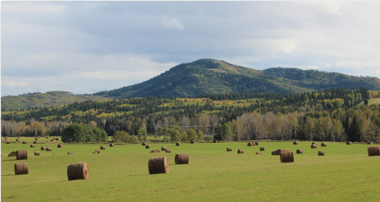
The foothills of Foothills County.