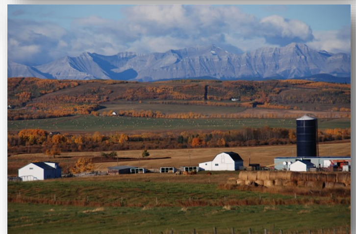
Farm near Millarville.