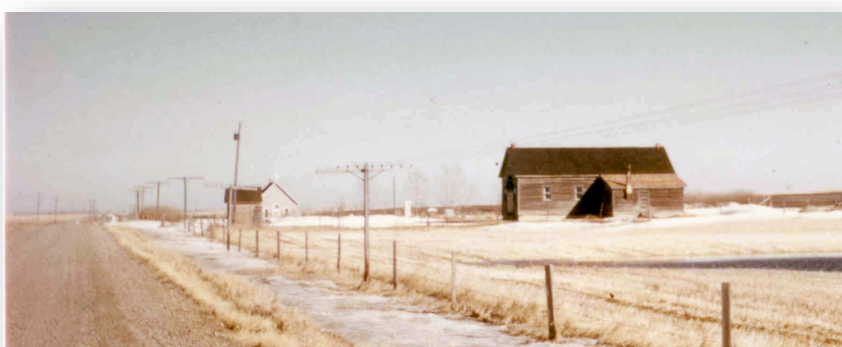
Dinton Hall with St. Thomas Anglican Church in background, 1959.

Source: Gladys-Dinton Through the Years.