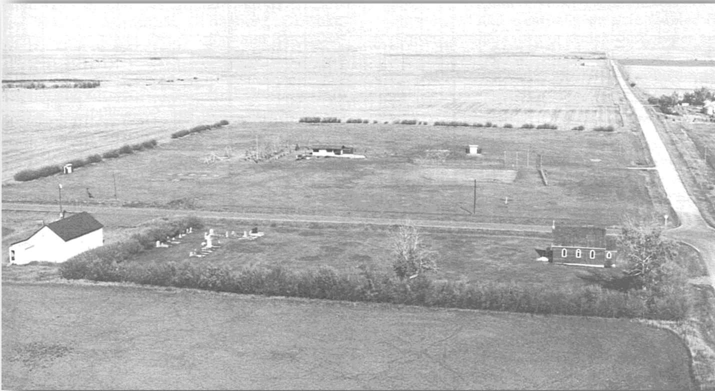
The Dinton Hall, at left, and the St. Thomas Anglican Church and cemetery.