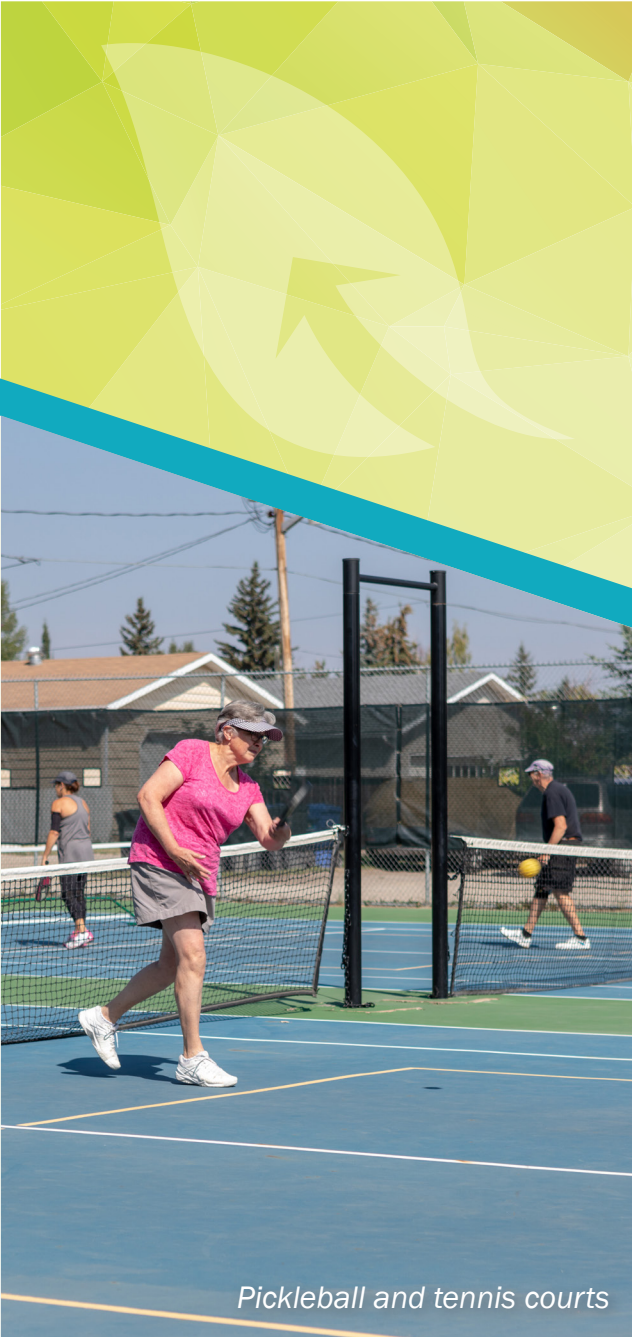
Pickleball and tennis courts

More details descriptions of the principles, themes and values can be found at okotoks.ca/community-vision .