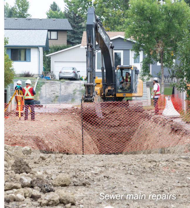
Sewer main repairs