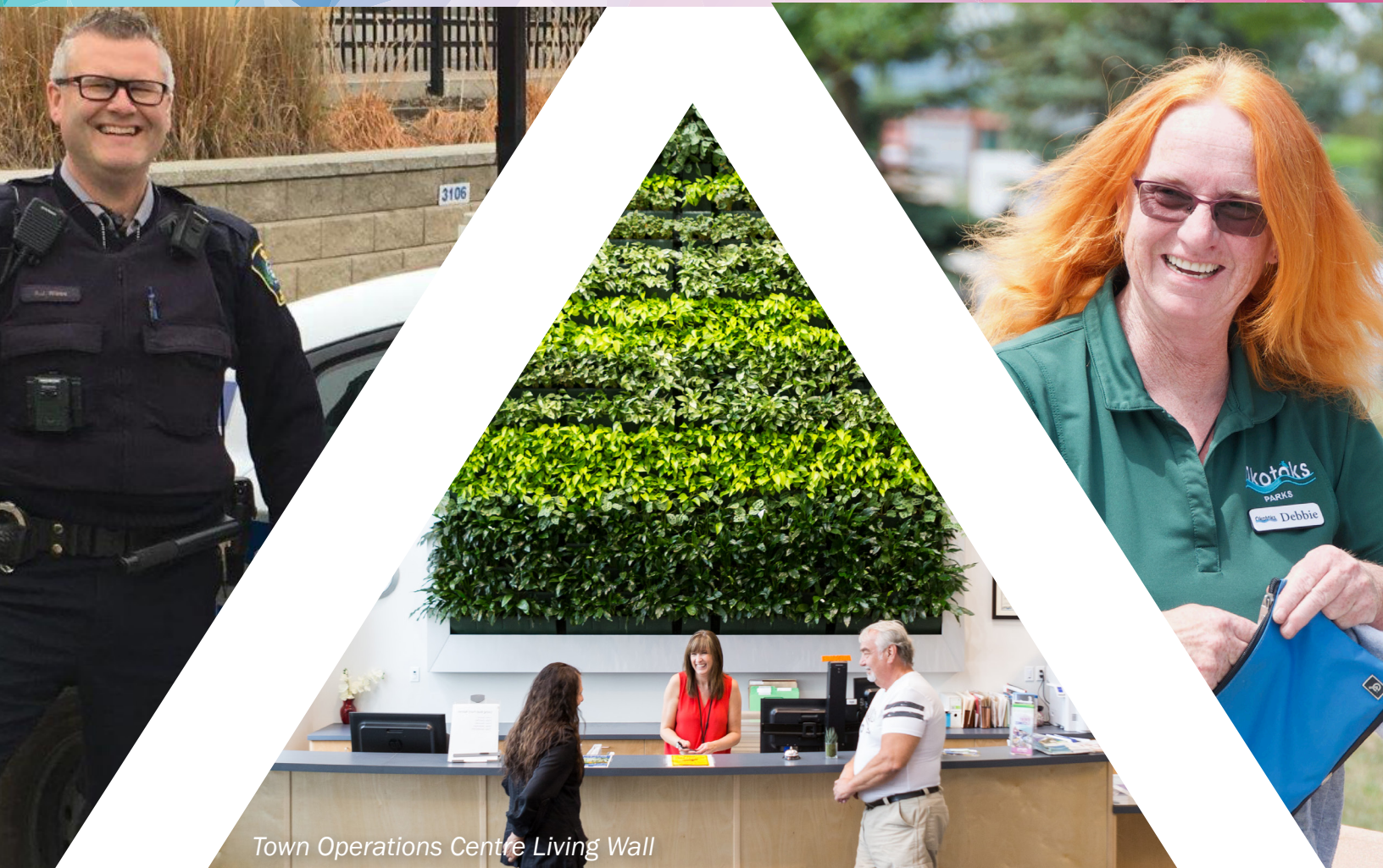
Town Operations Centre Living Wall