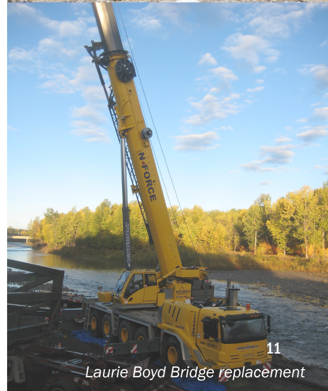
Laurie Boyd Bridge replacement