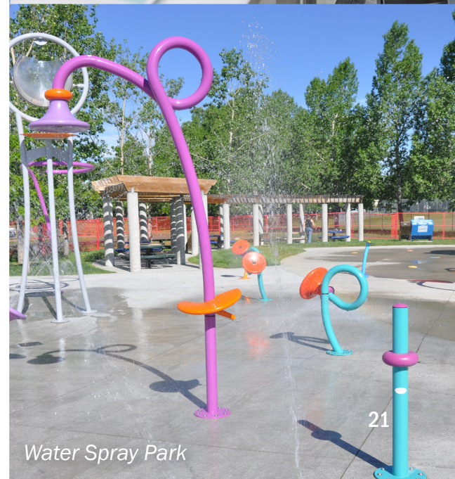
Water Spray Park