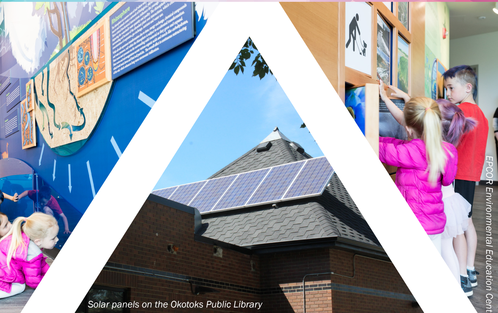
Solar panels on the Okotoks Public Library