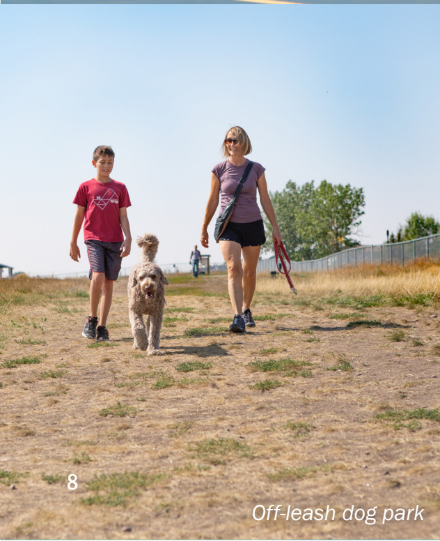
Off-leash dog park